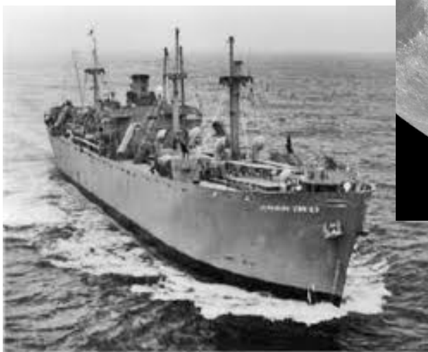
A WWII liberty ship named in Miss Mitchell's honor

Maria Mitchell is well-known for her quote , "We have a hunger of the mind. We ask for all of the knowledge around us and the more we get, the more we desire." She truly loved learning and she truly was a great astronomer.